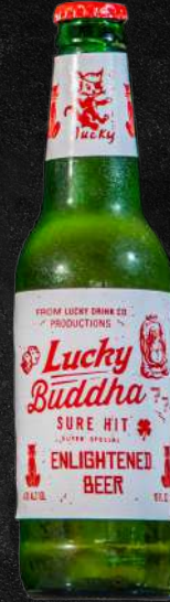
LUCKY BUDDHA BEER