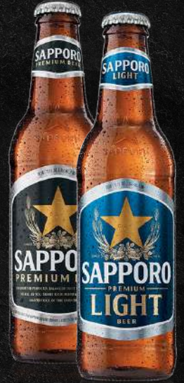
SAPPORO PREMIUM & LIGHT